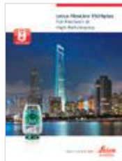
Leica FlexLine TS09plus Product brochure

Illustrations, descriptions and technical data are not binding. All rights reserved. Printed in Switzerland – Copyright Leica Geosystems AG, Heerbrugg, Switzerland, 2012. 781679en – VI.13 – galledia