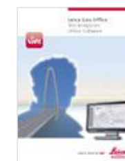
Leica Viva LGO Product brochure