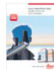
Leica SmartWorx Viva Product brochure