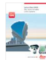
Leica Viva GNSS Product brochure