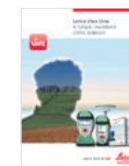
Leica Viva Uno Product brochure