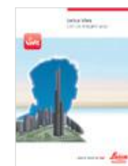
Leica Viva Overview brochure

Illustrations, descriptions and technical data are not binding. All rights reserved. Printed in Switzerland – Copyright Leica Geosystems AG, Heerbrugg, Switzerland, 2011. 792398en – VI.13 – galledia