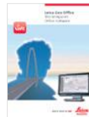
Leica Viva LGO Product brochure