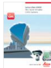
Leica Viva GNSS Product brochure