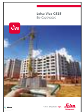
Leica Viva GS15