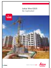
Leica Viva GS15