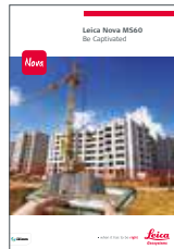
Leica Nova MS60

Illustrations, descriptions and technical data are not binding. All rights reserved. Printed in Switzerland – Copyright Leica Geosystems AG, Heerbrugg, Switzerland, 2015. 836338en – 05.15 – INT