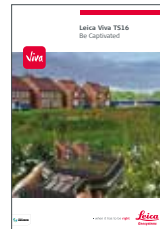
Leica Viva TS16