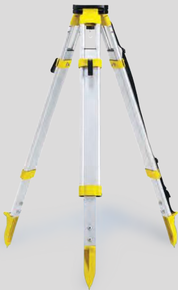
CTP104 round-base tripod Aluminium tripod with carrying straps, fast clamps, 5/8" screw. Telescopic from 85-160 cm Item no. 767 710

Optimise the performance of your Leica NA700 level with the specially tailored accessories.