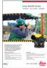
Leica NA300 Series Flyer

PROTECT is subject to Leica Geosystems' international manufacturer warranty and the general terms and conditions for PROTECT. For more information visit www.leica-geosystems.com/protect