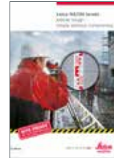
Leica NA700 Series Brochure