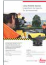
Leica NA500 Series Flyer